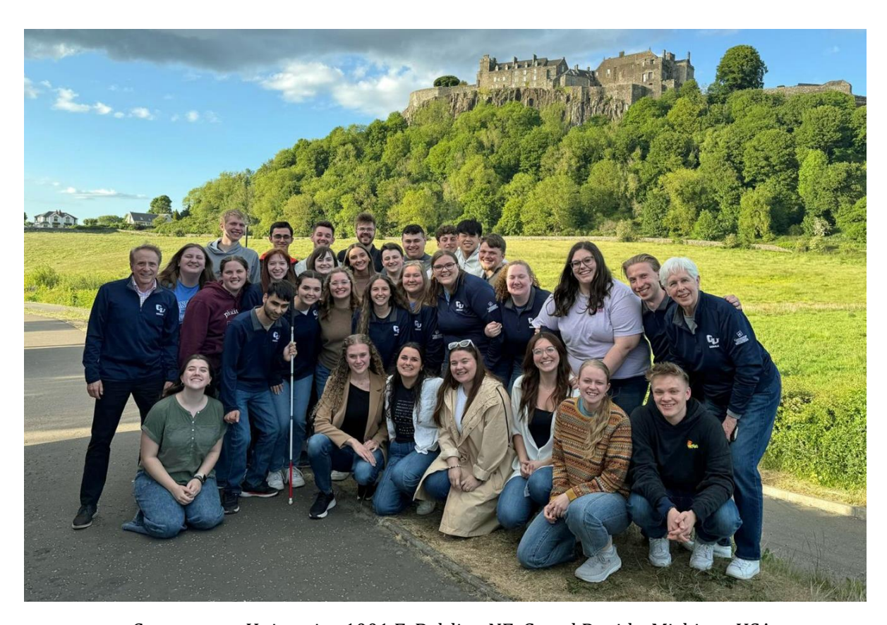
Cornerstone University, 1001 E. Beltline NE, Grand Rapids, Michigan USA